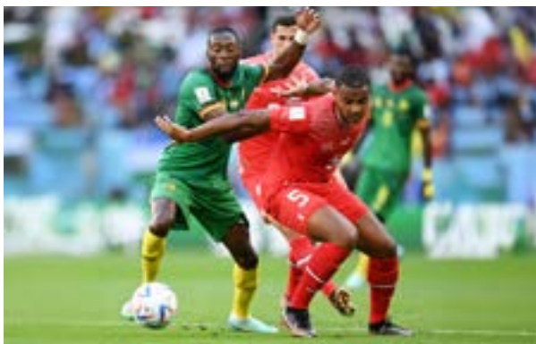
Regular vision during a match between Cameroon, playing in green, and Switzerland, playing in red.

Colour Blind Awareness offers further training on colour blindness and its impact on football. Several websites, such as WebAIM: Contrast Checker , allow you to visualise how people with colour vision deficiency would see your photos and content.