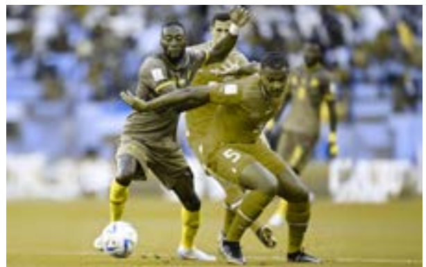
Colour vision deficiency simulation where it is very difficult to distinguish opposing players.